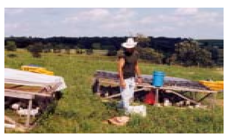
A farmer checks on his pastured poultry pens.

The model of a 5,000-bird operation (a primary enterprise) showed annual net returns to labor and management of over $18,000 in its tenth year. This would involve a 35 to 42 hour work week