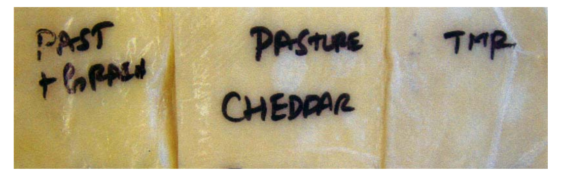
Figure 2. Color images of the three cheese types depicting the differences in hue.

Color Differences: Major color differences were apparent at every cheesemaking trial. Confirmed by colorimetric analysis, the TMR cheese was generally whiter, the cheese from cows fed pasture with grain supplement was the most yellow, and the cheese from cows fed exclusively on pasture was intermediate in color (Figure 2, below).