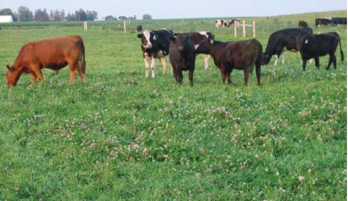
Holstein steers gained as well as beef steers in 2005 and 2006.

In 2005, the animals on the tall fescue pastures gained the most weight per unit of land (i.e. pounds per acre) compared with the other pasture forages. Kura clover interseeded with soft-leaf fescue and soft-leaf fescue alone were close behind. (The mix of white clover and soft-leaf fescue was not measured in 2005 or 2007, due to severe winter damage.) The animals on the orchardgrass pastures showed the lowest rates of gain in 2005 due to lower productivity and subsequent carrying capacity. This was not unexpected, as tall fescue in small plot trials has routinely outyielded orchardgrass. The 2006 grazing season was the best of the three years.