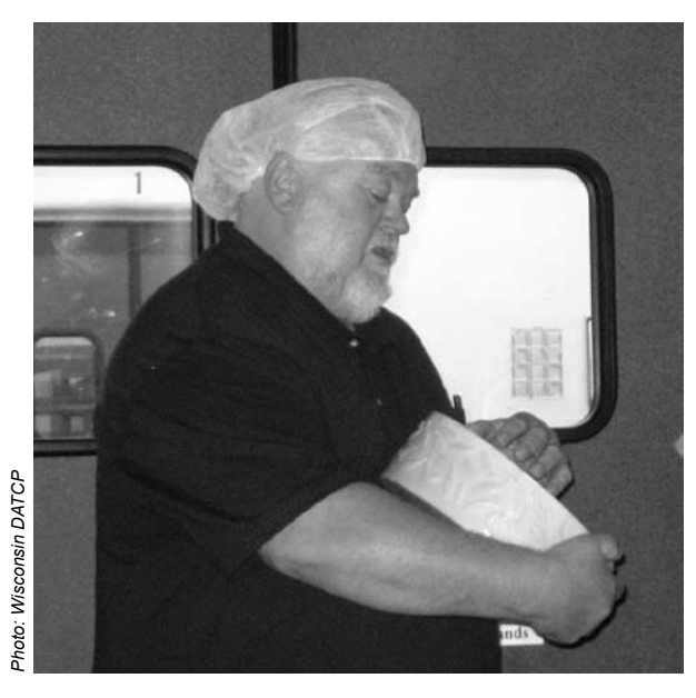
based flavors and textures (Rankin 2008, personal communication).

To date, the flavor and culinary characteristics of grass-fed milk are not well defined, but many recent anecdotal observations among makers of grass-fed artisan dairy products have confirmed flavor, chemistry and physical differences in products made with milk from pastured cows. For example, the PastureLand Cooperative, a group of four grazing farms in Minnesota, makes an awardwinning pastured butter that is naturally yellow and has a softer texture than conventional butter. It is spreadable at refrigerator temperature as a result of different types and ratios of fatty acids in milk from pastured cows.