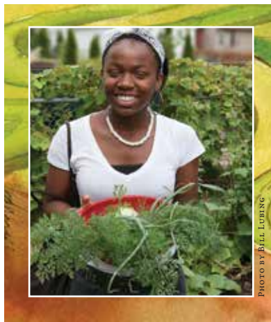
This middle school student loves vegetables she helped grow in her school's summer garden program.

Their grassroots initiatives became known as "Farm to School," programs that connect schools