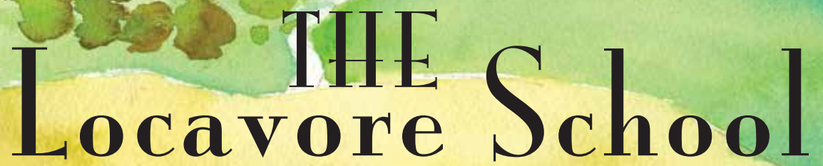
ILLUSTRATION BY DIANE DOERING

A program with deep roots at CALS helps school districts around Wisconsin serve fruits, vegetables and other goods from local farmers—and introduces children to the joys and benefits of healthy eating.