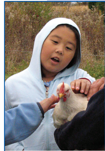
A Madison student meets a chicken on a farm field trip

Farm to School programs provide a variety of benefits to students, school nutrition programs, teachers, parents, farmers and communities. These are outlined in the benefits of farm to school tool. Farmer benefits include increased market diversification and an average five percent increase in income from farm to school sales. Student impacts include strengthened knowledge about and attitudes toward agriculture, food, nutrition and the environment. Farm to school can also boost student participation in school meal programs, increase consumption of fruits and vegetables and increase market opportunities for farmers, ranchers, food processors and food manufacturers.